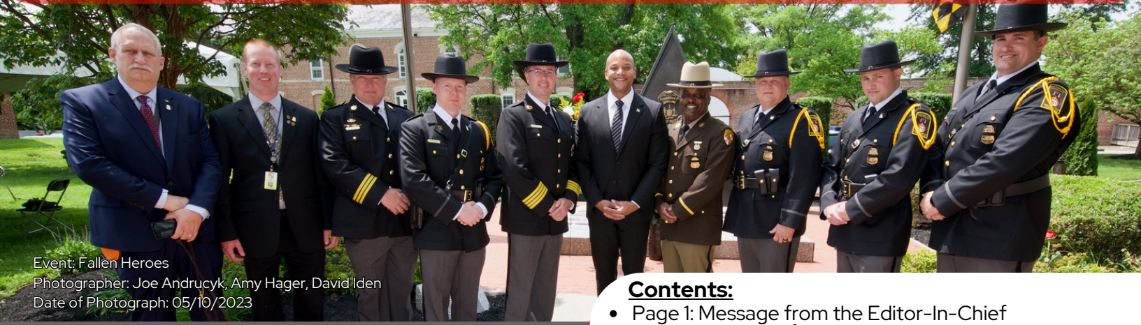
Event: Fallen Heroes Date of Photograph: 05/10/2023