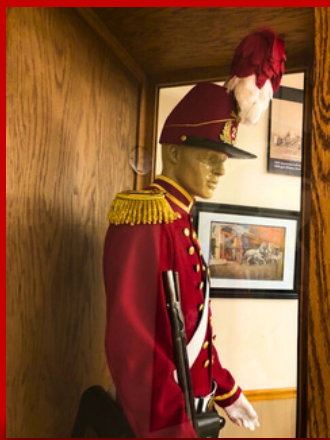
"The reproduction of a Junior Fire Company "Junior Defender" militia unit uniform that was most likely worn by the fire company militia unit during John Brown's Raid on Harper's Ferry is one of the newest displays at the Frederick County Fire & Rescue Museum."